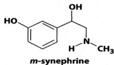
Fig. 2 Chemical structure of m -synephrine.